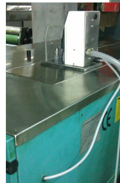
Drop-In Alcohol unit shown fitted to competitor's Dampening Chillers